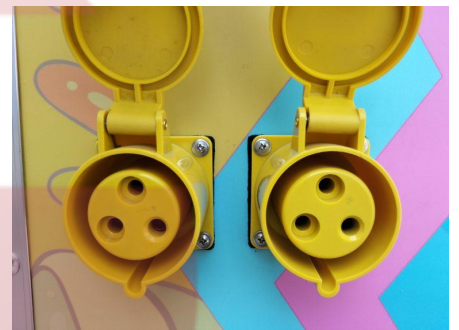
- Generator Receptacle -