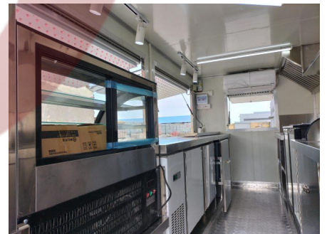
- Inside -