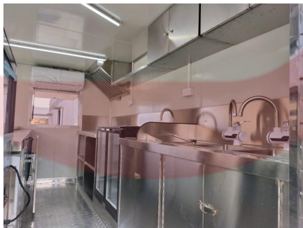
- Inside -