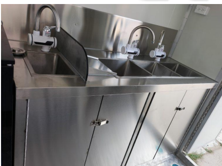
- Sinks -