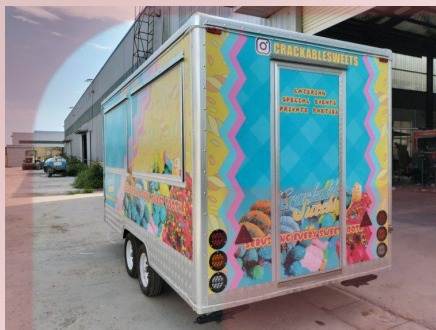
- Door -