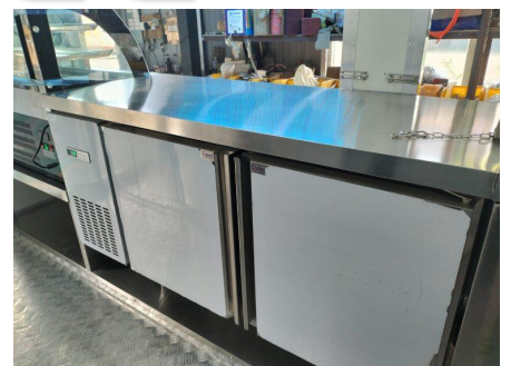
- Fridge -