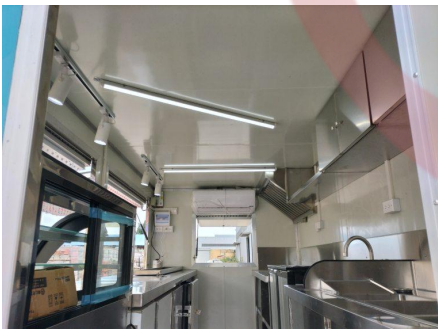
- Inside -